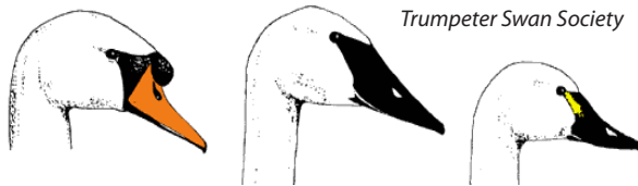
Mute Swan Trumpeter Swan Tundra Swan

The most notable difference between the mute swan and the two native swan species found in Michigan (trumpeter swan and tundra swan), is that adult mute swans have orange bills.